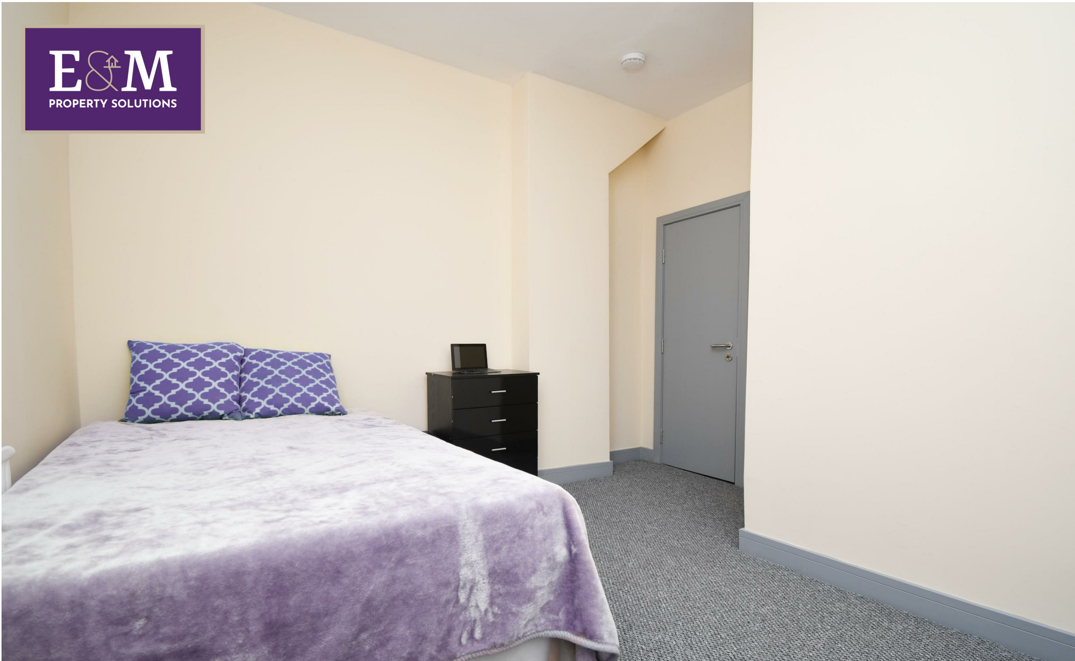
ROOM 4, 10 Renshaw Street, Burnley, Lancashire, BB10 1SX £105 Per week